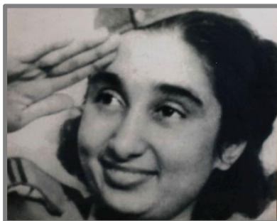
Captain Lakshmi Sahgal (1914-2012)