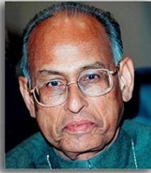
L.M. Singhvi (b.1931–d.2007)

Laxmi Mall Singhvi, popularly known as L. M. Singhvi was a scholar-statesman, a prolific author, poet, linguist and litterateur, an eminent jurist, a distinguished diplomat and a prominent parliamentarian.