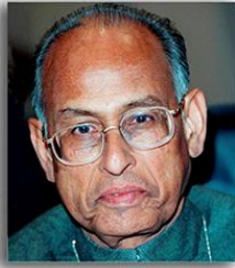
L.M. Singhvi (b.1931–d.2007)

Laxmi Mall Singhvi, popularly known as L. M. Singhvi was a scholar-statesman, a prolific author, poet, linguist and litterateur, an eminent jurist, a distinguished diplomat and a prominent parliamentarian.